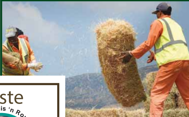
Loading the truck!